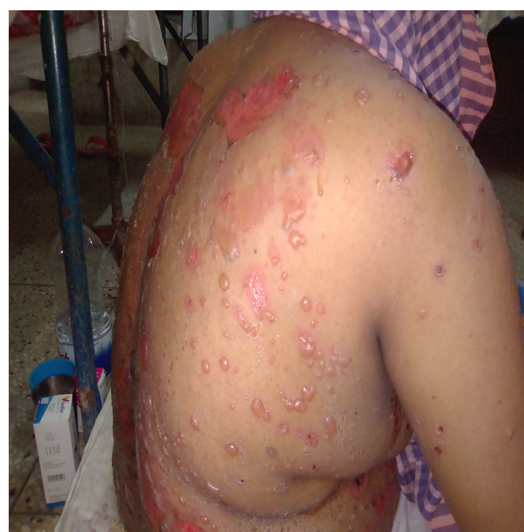
Figure 1. Pemphigus vulgaris

Among the 89 patients, PV was 76 (85.4%), PF was 11 (12.3%), PE was 1 (1.2%) and paraneoplastic pemphigus was 1 (1.2%). Among the patients of PV, male and female patients were 35 (46.1%) and 41 (53.9%) respectively and male to female ratio was 1:1.7. In case of PF male and female patients were 3 (27.3%) and 8 (72.7%) respectively and male to female ratio was 1:2.7. 16.85% patients presented with only mucosal involvement, 9% of the disease initially presented by skin only and 74% showed both mucosal and skin involvement. Among the different varieties of pemphigus, 67.4% had the duration 1 to 6 months and 11.2% had the duration 7 to 12 months and 1.1% had the duration 13 to 18 months and 5.6% had the duration more than 18 months.