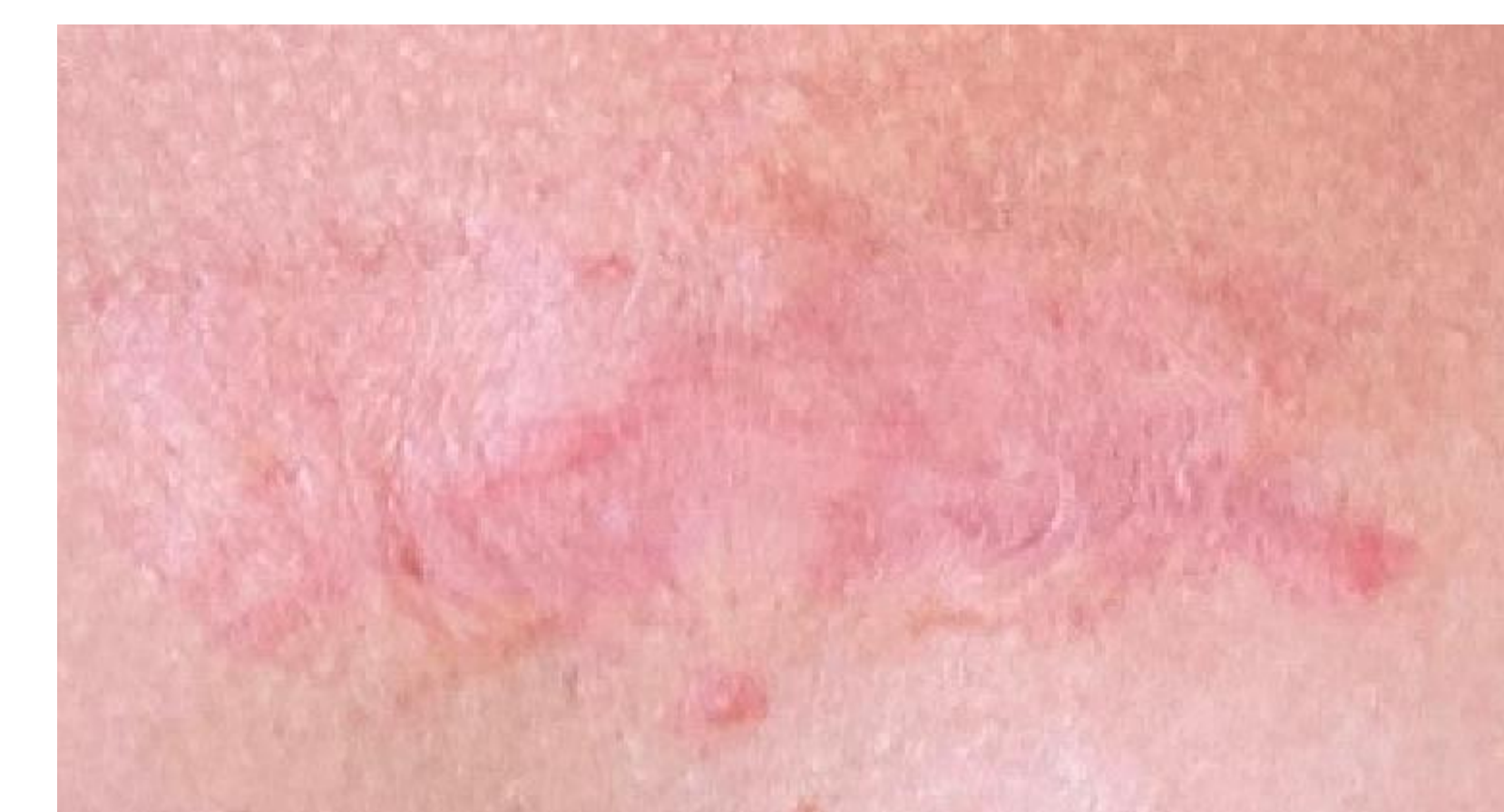
Figure 3. 6/2020, after serial treatments with ILK + 5-FU x 6 and PDL x 1.

Intermittent ILK throughout treatment course