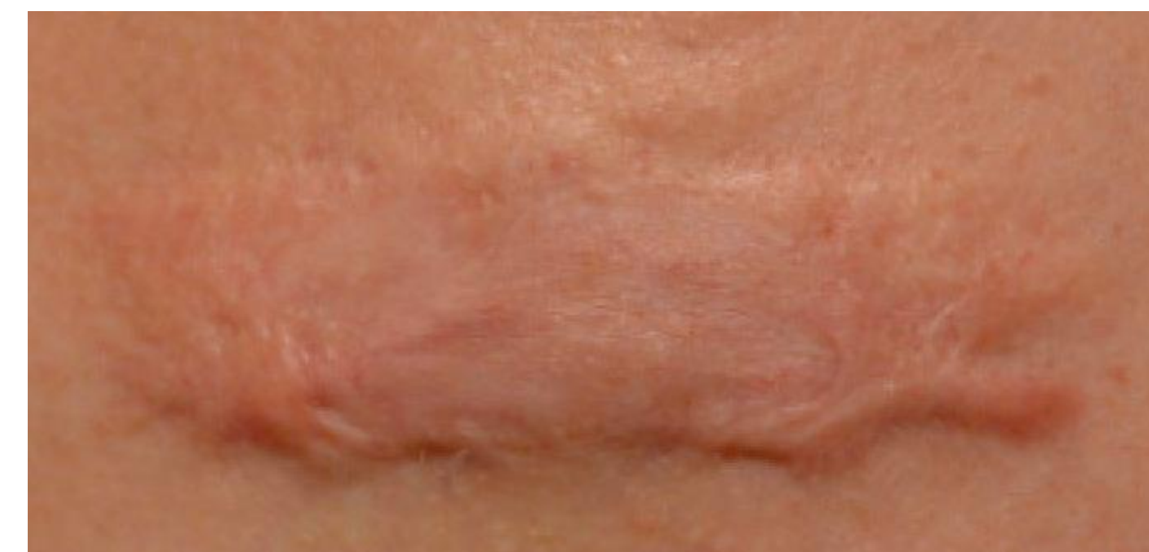
Figure 2. 7/2018, after almost 3 years of tofacitinib therapy with only intermittent ILK to keloid.