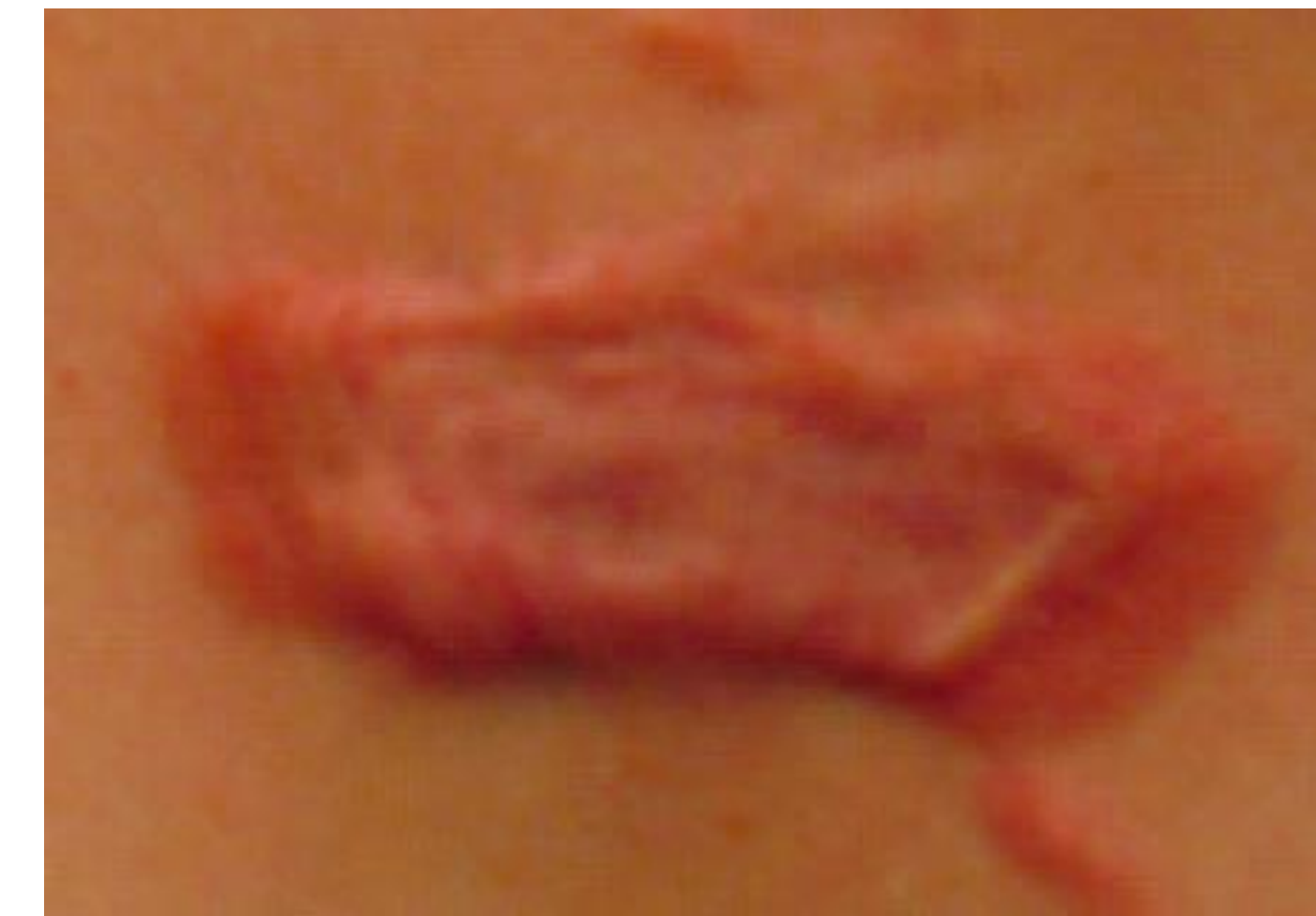
Figure 1. 7/2015, prior to initiating tofacitinib therapy for AA.