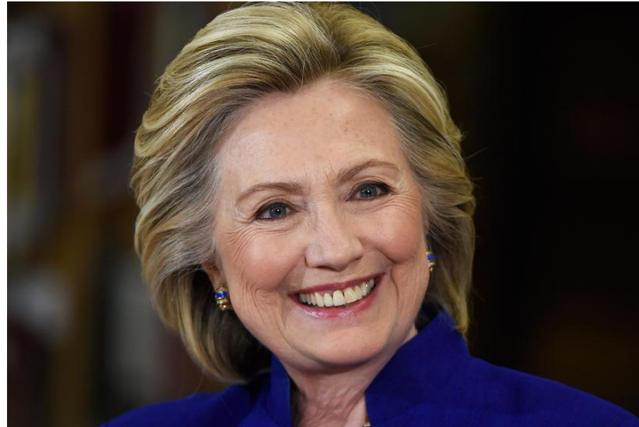
Hillary Clinton (First Lady President?)