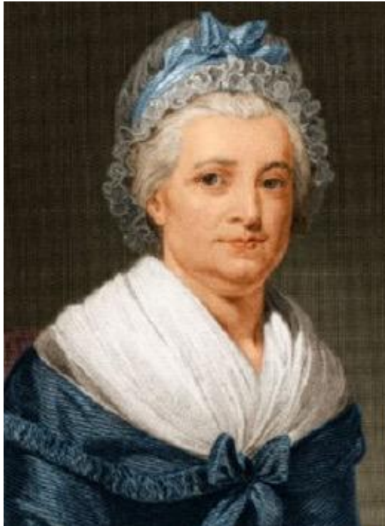
Martha Washington (First First Lady)