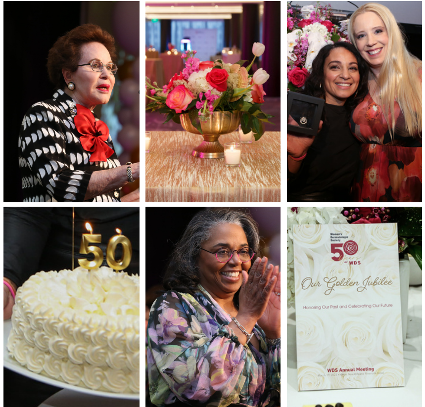
Photos from the WDS 2023 Annual Meeting celebrating the 50th Anniversary of the Women's Dermatologic Society.